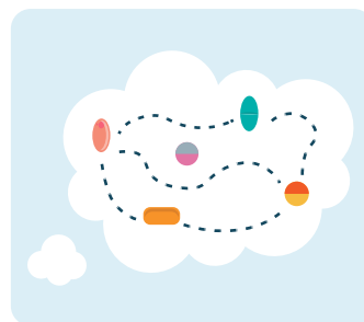
COMPLICATED DOSING REGIMENS