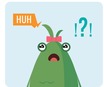
MISUNDERSTANDING DIRECTIONS & HEALTH LITERACY

Our expert pharmacists will establish themselves as a caring member of the patient's healthcare team and address these issues in a way that is manageable for each individual patient. Additionally, the pharmacist will contact the pharmacy and/or prescriber, where appropriate, to facilitate the on-time refills of the target medication.